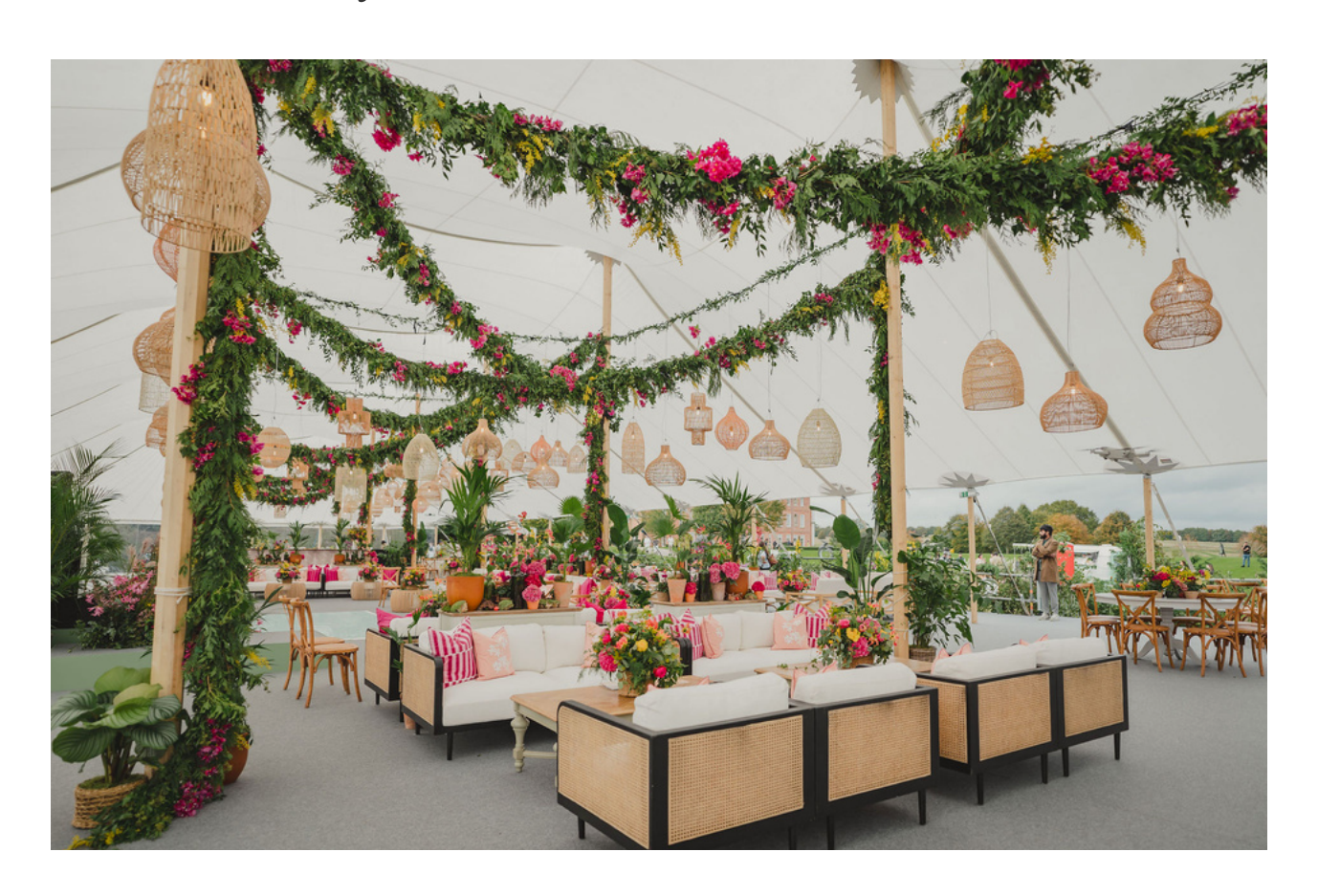
Here's a curated selection of our work.

At La Fête, we're known for our exquisite design concepts and attention to every luxurious detail — although you'll want to see for yourself.