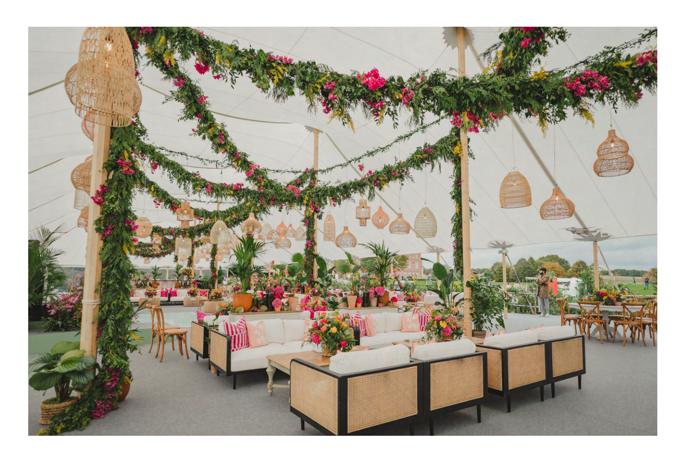
Here's a curated selection of our work.

At La Fête, we're known for our exquisite design concepts and attention to every luxurious detail — although you'll want to see for yourself.