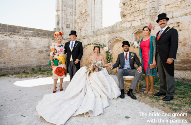
The bride and groom with their parents