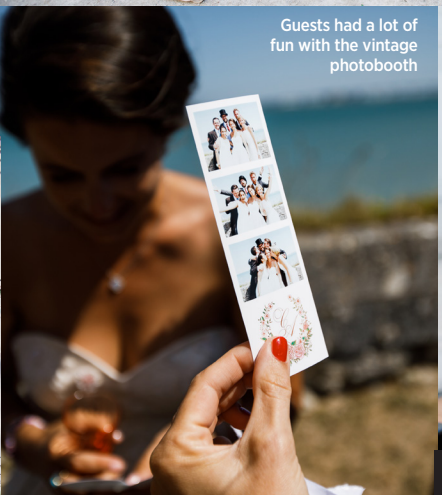
Guests had a lot of fun with the vintage photobooth