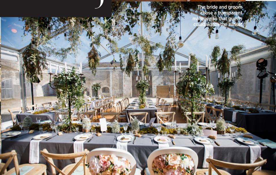
The bride and groom chose a transparent marquee so that guests could watch the sunset