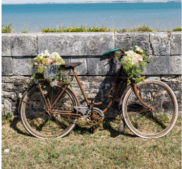
The Île de Ré is renowned for cycling, so the couple chose to use bicycles as photo props