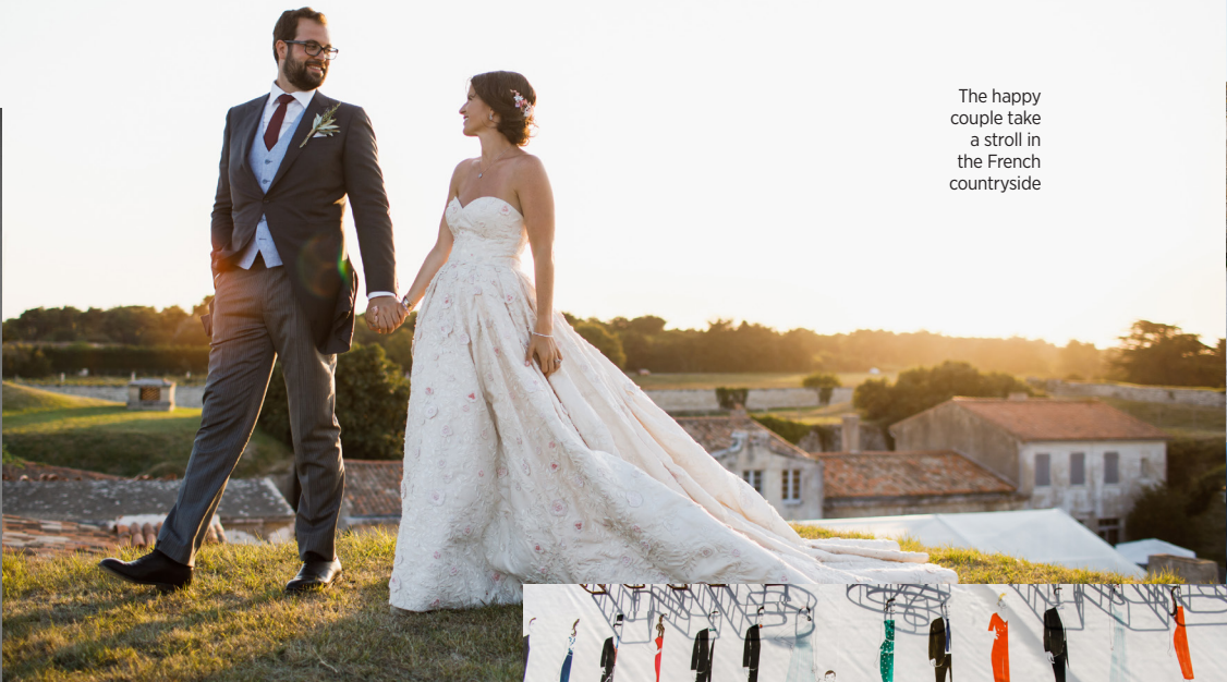
The happy couple take a stroll in the French countryside