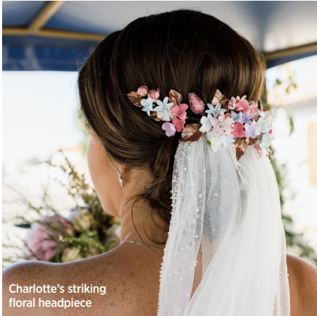
Charlotte's striking floral headpiece