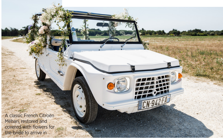
A classic French Citroën Méhari, restored and covered with flowers for the bride to arrive in