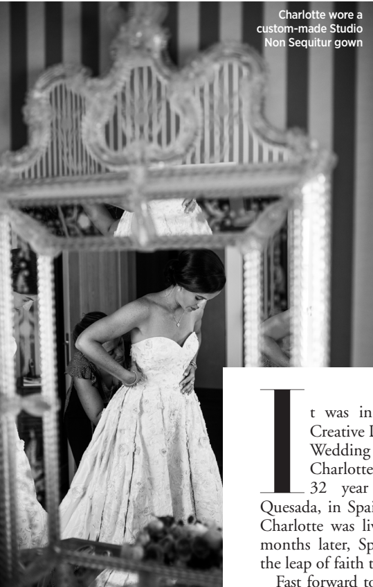
Charlotte wore a custom-made Studio Non Sequitur gown