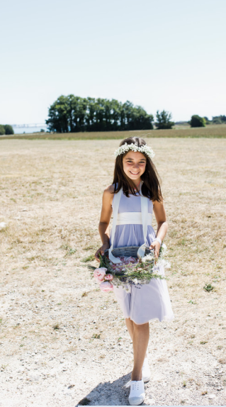
The bride's flower girl carried a basket of fresh rose petals