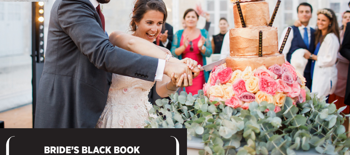
The four-tier vanilla and milk chocolate cake was served with salted caramel sauce