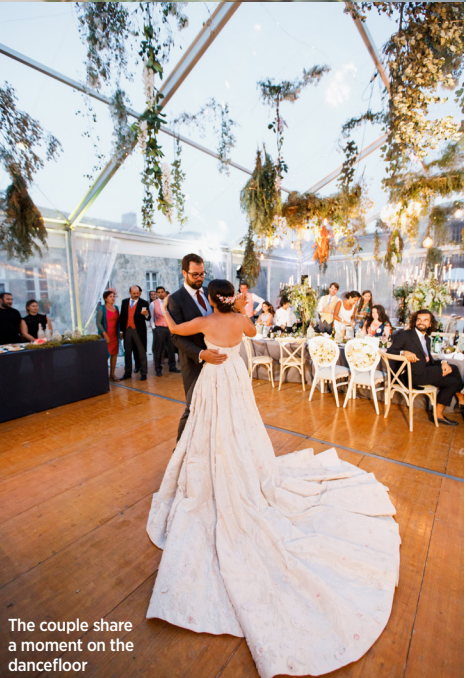
The couple share a moment on the dancefloor

CHAIRS: Couture Chairs, Couturechairs.com