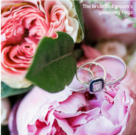
The bride and groom's glistening rings