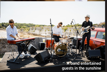
A band entertained guests in the sunshine