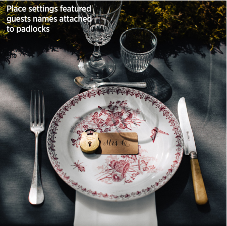
Place settings featured guests names attached to padlocks